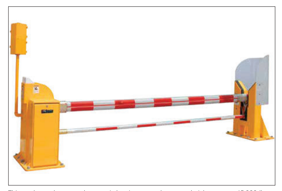
This crash-rated gate arm has a main barrier arm at the proper height to stop a 15,000-lb. truck, and a lower secondary arm added to prevent accidental crashes by shorter passenger vehicles, which could be fatal if the car's windshield crashed into the truck-height barrier.

Proper drainage is critical to the correct function of the bollard.