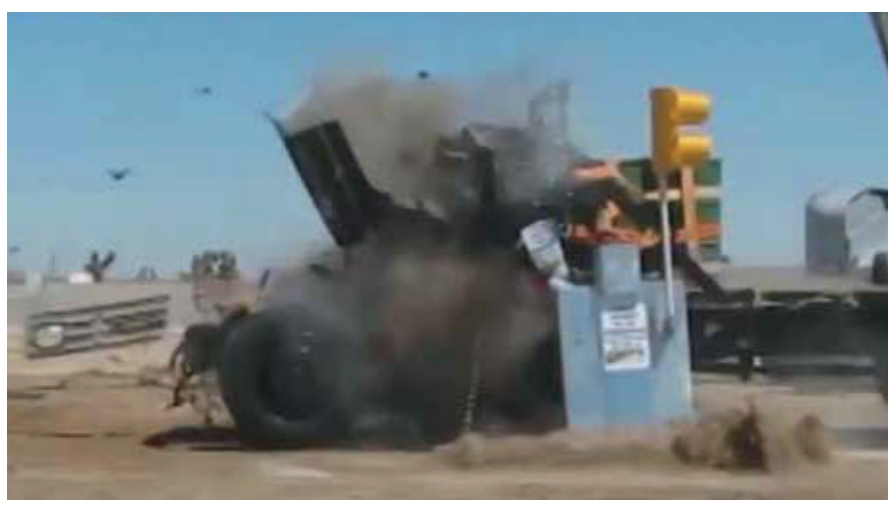
This video frame shows the moment of impact in a crash test. The front of the 15,000-lb truck moving at 30 MPH is cut apart by the barrier arm, but the bed of the truck (where the explosives would be) does not penetrate past the perimeter line.

Their crash-resistance is tested by crashing trucks into them. The standard, ASTM F2656, Standard Test