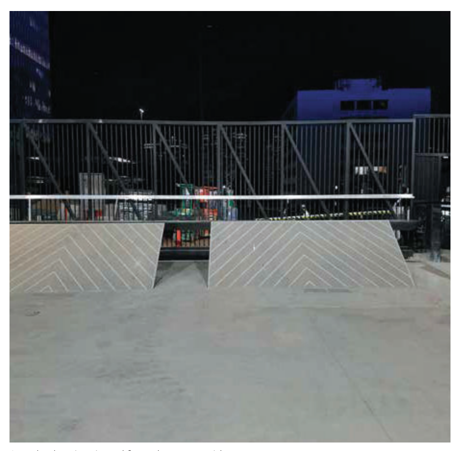
A wedge barrier viewed from the secure side.

Retractable bollards generally have the deepest and most demanding foundation requirements — three to five feet — because the entire length of the bollard must go down into it.