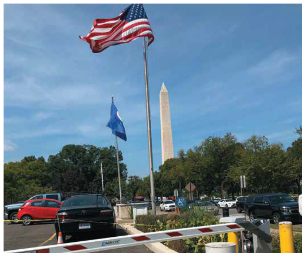
Retractable bollards, along with a conventional gate arm, defend the headquarters of the USDA in Washington DC. Levels of perimeter security that have been standard for decades at government and military facilities are now being adopted widely in the private sector, as well.