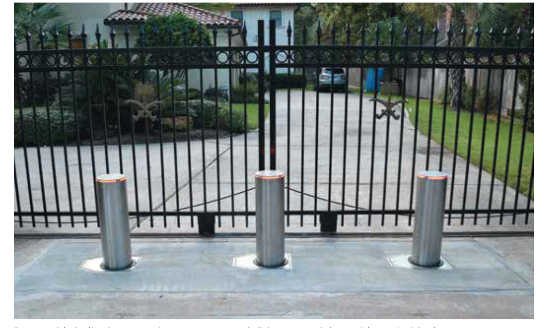
Retractable bollards, protecting an ornamental slide gate and the residence inside the gates. The bollards have LEDs along the top rim to increase their visibility.

A bollard is essentially a short post that blocks a road or path. The name originally applied to the mushroom-shaped posts used to tie up ships on docks and quays. Modern bollards vary widely in style, from a concrete-filled pipe to an ornamental work of cast iron, a red concrete sphere outside Target stores that looks like the brand's logo.