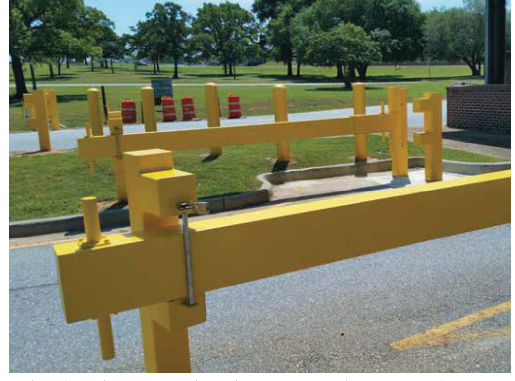
Crash-rated manual swing arms, seen here in the open position, are the most economical form of crash-rated active barrier.

Crash-rated reinforcement can be integrated into a full-size sliding gate, even an ornamental one. "That's the most fancy version," comments Erbeldinger. "You have the crash arm built into the frame of the gate. Because the crash arm is doing all the heavy lifting, whatever infill you have