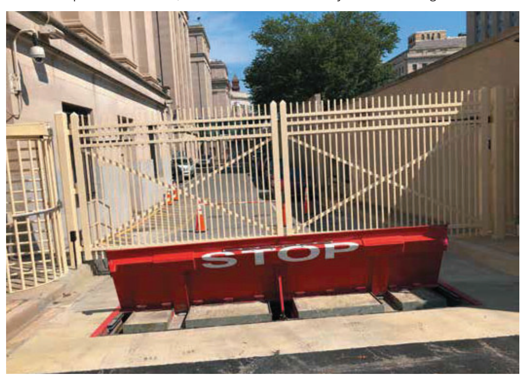
A wedge barrier, seen from the business side, protects an ornamental gate entrance.

or retractable. A removable bollard is a free post set into a matching receiver-sleeve. The sleeve is permanently installed in the ground with the